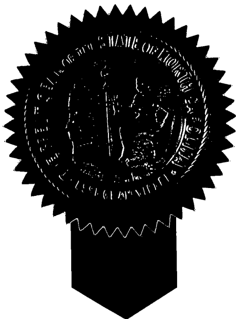
Beverly Eaves Perdue Governor

Done in Raleigh, North Carolina, on December 20, 2011.